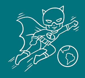
Never sit on the sidelines